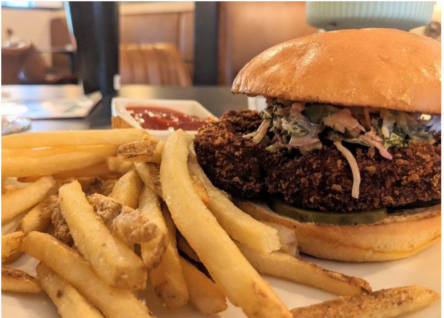
Six Horses Tavern recently renovated the dining room and menu. The fried chicken Schnitzel sandwich is an addition.

The dining room menu is more refined. Starters include mussels with grilled fennel in a tomato wine-garlic broth and a grilled baguette. And, of course, cheese and meat boards are available. The pasta section offers a vegan roasted vegetable and tofu stuffed ravioli with cashew bechamel, sundried tomatoes and spinach.